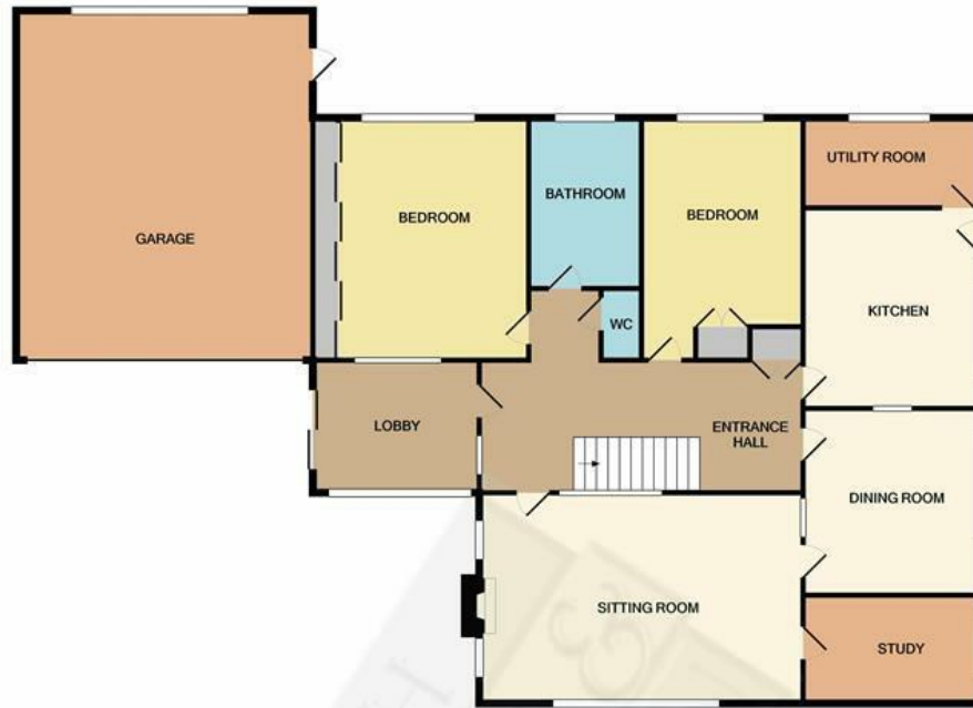
GROUND FLOOR APPROX. FLOOR AREA 1755 SQ.FT. (163.1 SQ.M.)