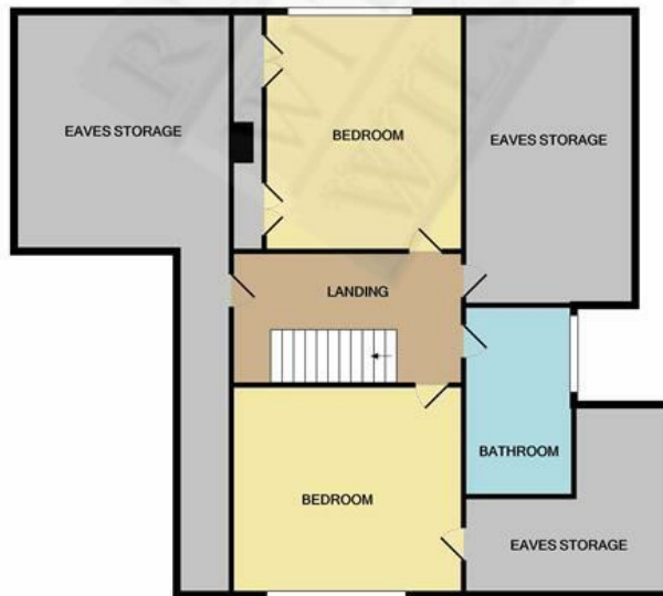
1ST FLOOR APPROX. FLOOR AREA 1180 SQ.FT. (109.7 SQ.M.)

TOTAL APPROX. FLOOR AREA 2936 SQ.FT. (272.7 SQ.M.)